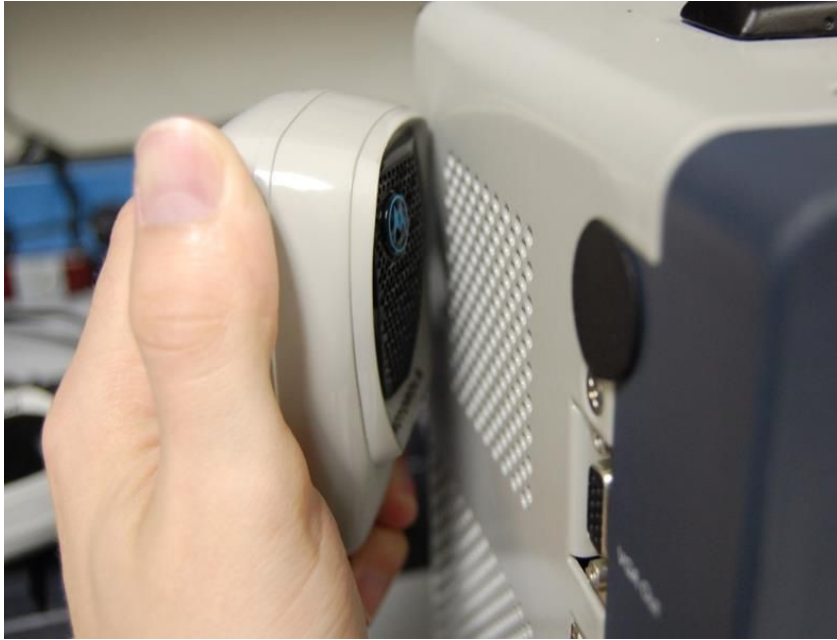
Figure 4-1. Place keyed microphone next to analyzer speaker.