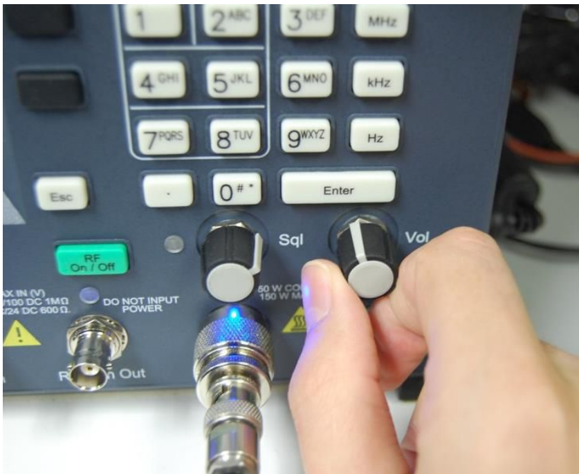
Figure 4-2. Adjust analyzer volume until about 4 kHz deviation is measured.