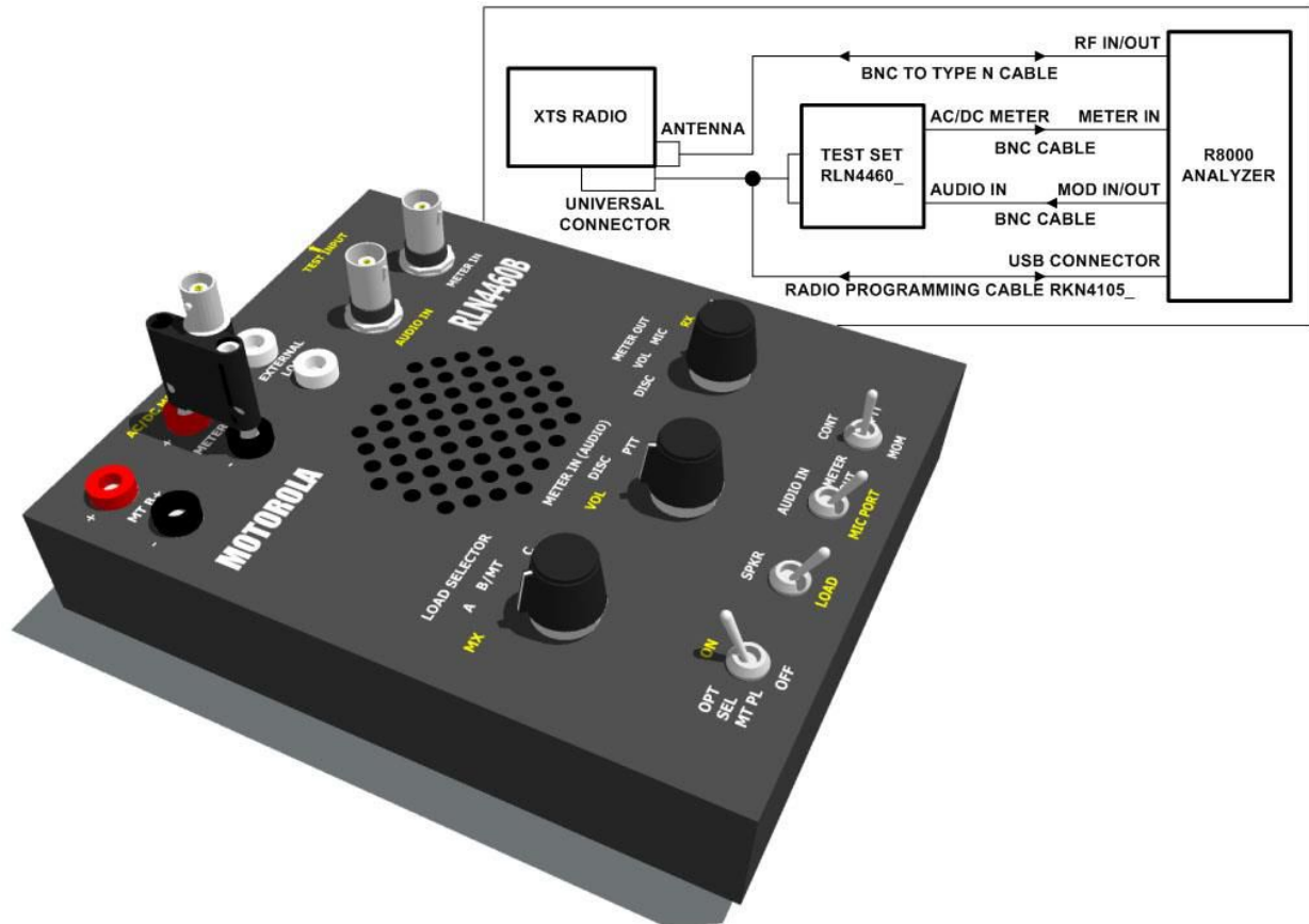
Figure 5-1. ASTRO® XTS™ Series Test Setup Diagram

Refer to the diagram below for the proper test setup. Note that the correct setting for each RLN4460 test set control is highlighted in yellow.