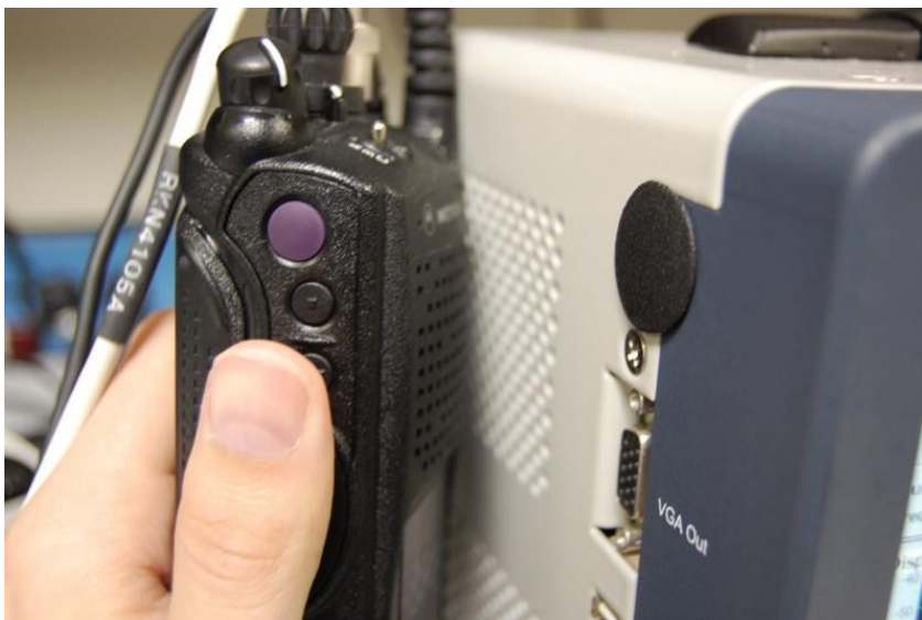
Figure 6-1. Place keyed radio next to analyzer speaker.

The radio is placed into Test Mode at the lowest TX Test Frequency. The analyzer is setup as specified in this section's Analyzer Configuration table. The user is instructed to key the connected radio and place it next to the analyzer speaker (see Figure 6-1). The user is also instructed to adjust the analyzer volume until about 4 kHz deviation is seen on the analyzer display (see Figure 6-2). The deviation level is then measured by the analyzer and the user is instructed when to un-key the radio. The measured deviation is compared against test limits and the final results are written to the log file.