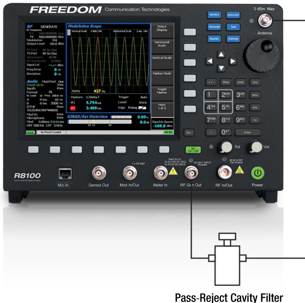
Figure 1 – Hookup to test a Pass-Reject cavity filter on the R8000 analyzer

Figure 1 shows the R8000 hookup for testing an individual pass-reject cavity filter. To maximize S/N for the measurement use the RF Gen Out and Antenna ports for the Generate and Monitor sides of Tracking Generator operation. The ports on the cavity filter may be labeled for a specific connection, and if so follow that convention – i.e. hook the RF Gen Out port on the R8000 to the Transmit/Input port on the cavity. Otherwise they can be treated as symmetrical connections.